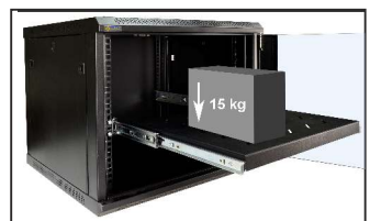
shelf loading capacity