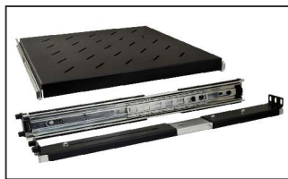
shelf with guides