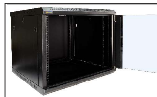
empty RACK 19" cabinet