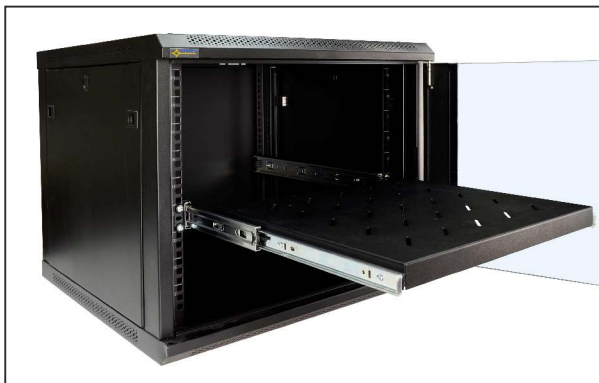
Full-extension slide of the shelf