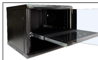
Full-extension slide of the shelf